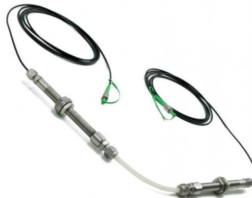
Example of SC 1000 T sensor (short version)